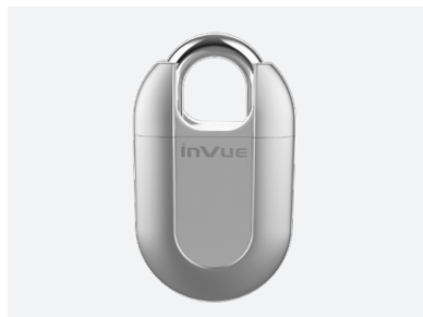
1 inch Shackle – Anti-cut Cover